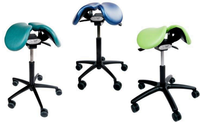
Ergonomic Salli chair