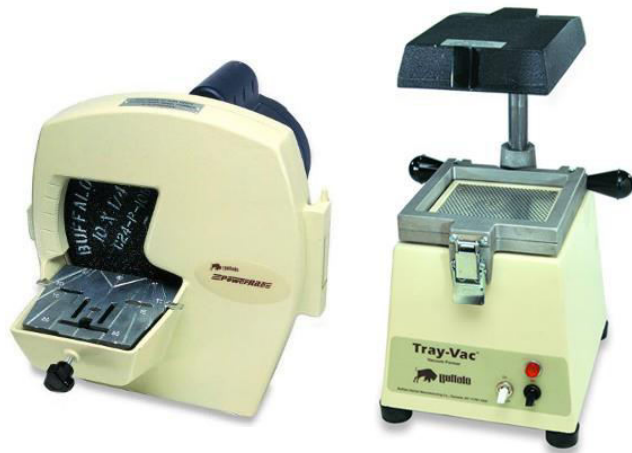
Model Trimmer & Vacuum Formers