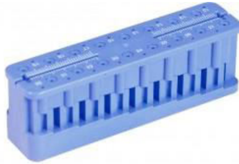
Endo Measuring block