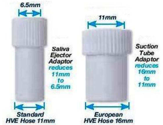
Suction Tube Adaptors