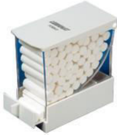
Cotton Roll Dispenser