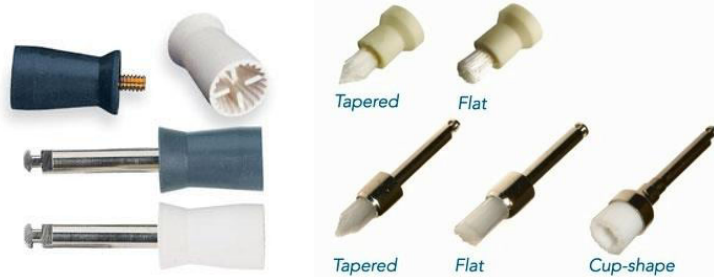
Prophy Cups & Prophy Brushes