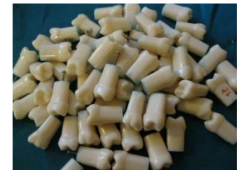
Phantom Head & Frasco teeth