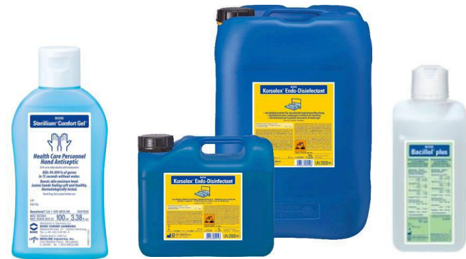
Antiseptics, Disinfectant & Sterilization