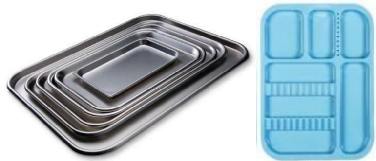
Instrument Trays : Metal & Plastic