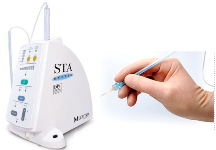
Single Tooth Anesthesia System