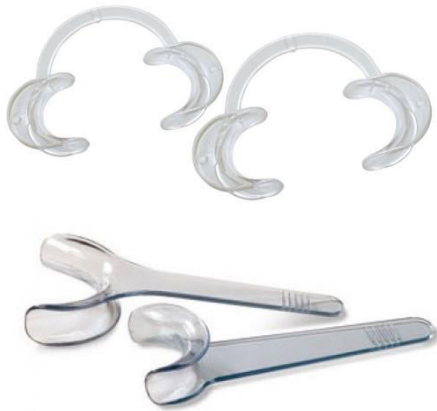
Autoclavable Cheek Retractor