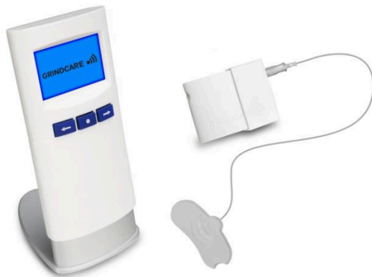
Grindcare : Solution For Bruxism