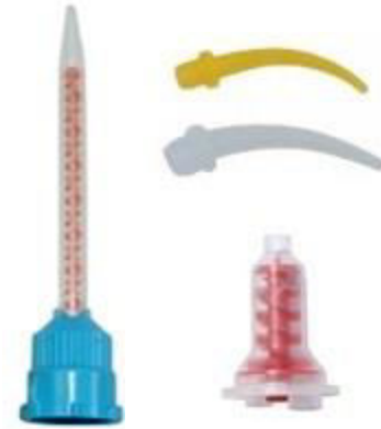
Syringe Tips & Mixing Tips