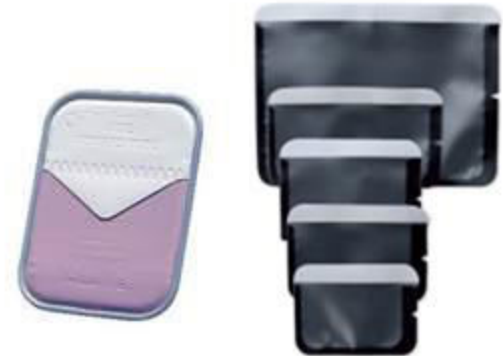
Dental X-rays & barrier Envelopes