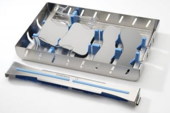
Intraoral Photography Mirrors