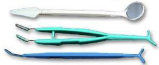
Disposable Diagnostic Sets