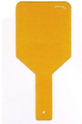
Light Hand Shield