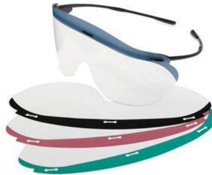
Disposable Eye Shields