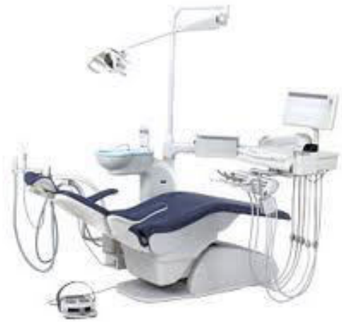
Dental Chair Unit