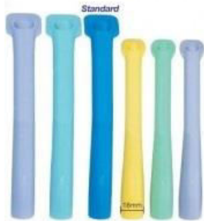
HVE Suction Tubes