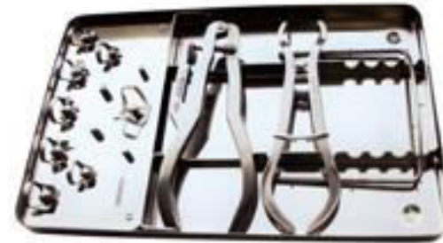
Rubber Dam Kit