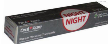
Plaque Disclosing Toothpaste