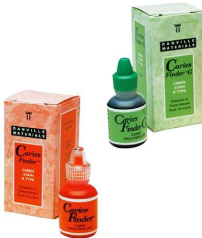
Caries Disclosing Dye