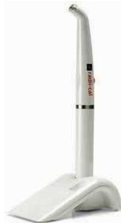
Light Cure Unit