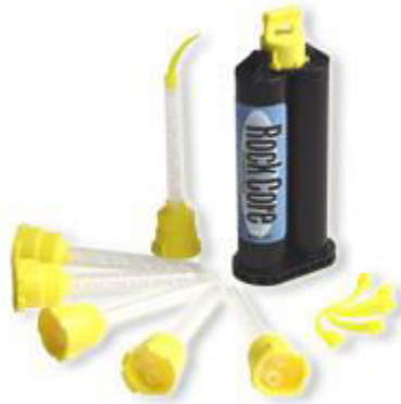
Core Build-Up Composite