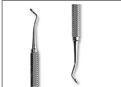
Pluggers and Condensers