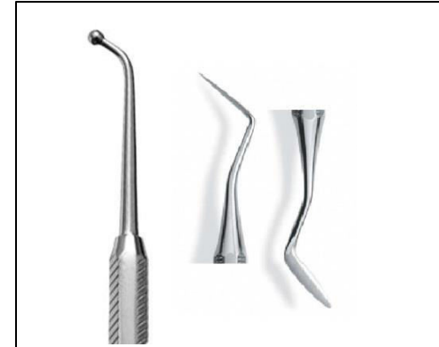
Burnishers and Carvers