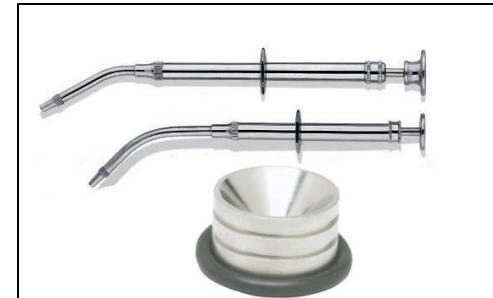
Amalgam Carrier and Amalgam Well