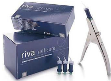
Glass Ionomer Cement